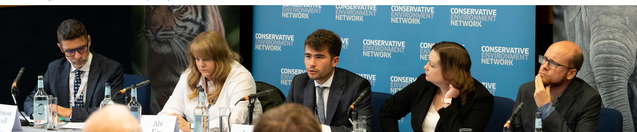
CEN nature panel at Conservative Party Conference, October 2022

We have championed policies to boost biodiversity while supporting increased housing development. To that end, we have worked with CEN MPs and Peers to table amendments to the Levelling Up and Regeneration Bill, including giving duties to national parks and AONBs to recover nature, creating a new Wildbelt planning designation for land where nature is being recovered, requiring swift bricks in new homes, and allowing local authorities to rescind peat extraction licences. We have gathered support for the amendments and supported the MP sponsors with their campaigning in the media. We supported a letter to the Prime Minister outlining the need for ambitious Biodiversity Net Gain requirements.