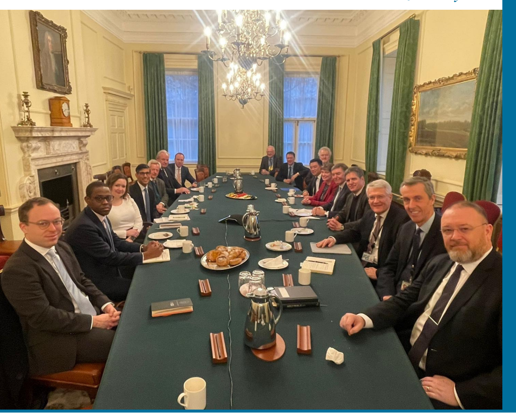
CEN MPs at Number 10 to meet the Prime Minister, January 2023

We hosted a major conference on a conservative approach to net zero, with a keynote speech from Energy Minister Graham Stuart and two panels of leading conservative thought-leaders on climate change.