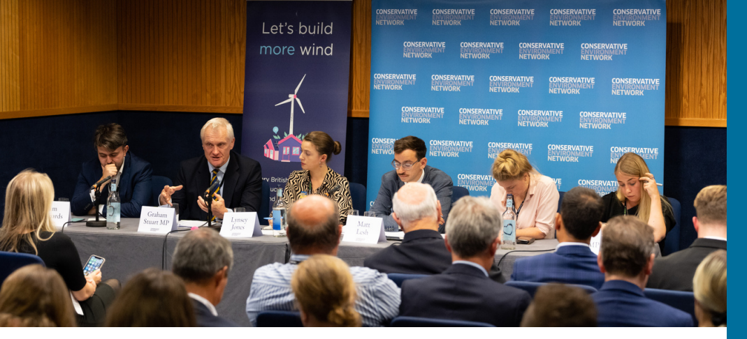
CEN climate panel at Conservative Party Conference, October 2022